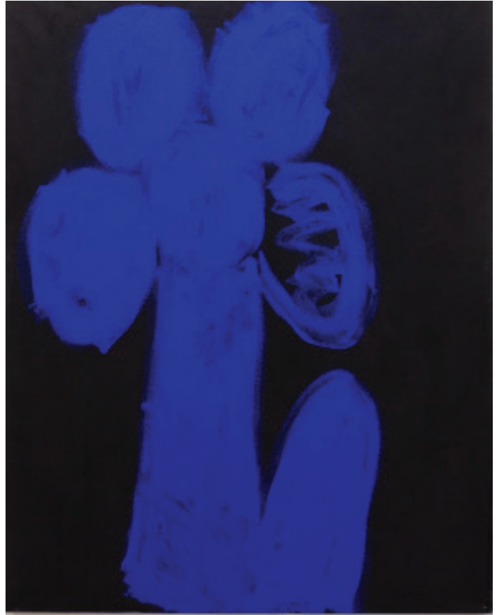
Blue Flower, 2020 - Taylor Stewart with SOUTHFIELD