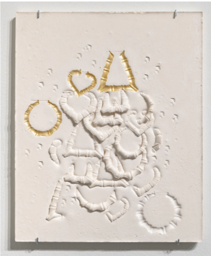
Door Knocker Composition with Three Gold and Nefertiti Heads, 2020 - LaKela Brown with REYES | FINN