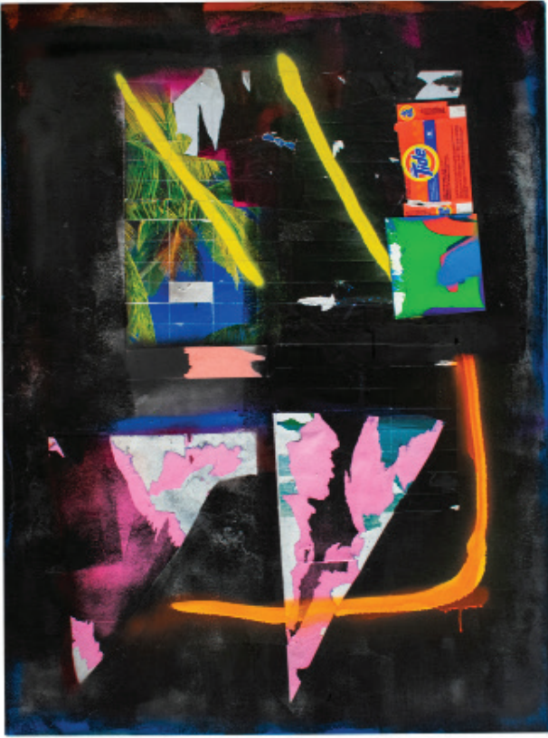
Artwork # 4 ( Tide ), 2020 - Vincent Troia with HARD GALLERY