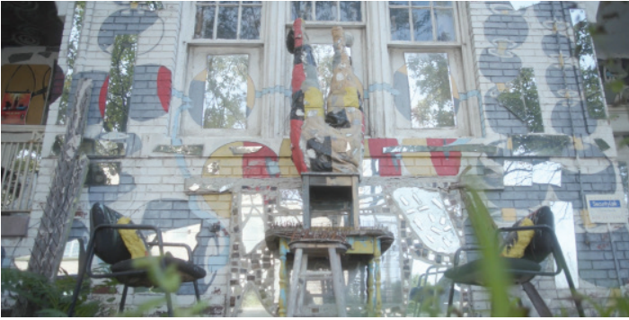
Dabls MBAD African Bead Museum - Olayami Dabls