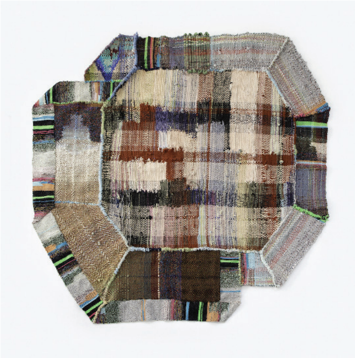
Interchange (A,i) , 2020 - Paula Schubatis with Next Space