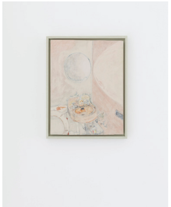
Untitled (Norwalk & Lumpkin) , 2020 - Hamtramck Ceramck