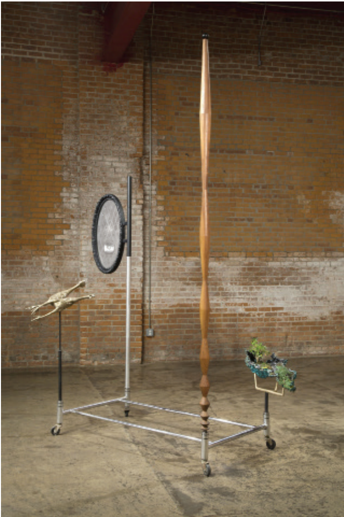
Oddly Familiar, 2020 - Graem Whyte with ARTWORK