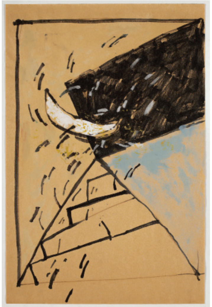
Moonhorn in My Studio , 1985 - Allie McGhee with HILL Gallery