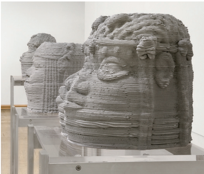
Dark Povera- Manufactured Primitives , 2019 - Matthew Angelo Harrison with Cranbrook Art Museum