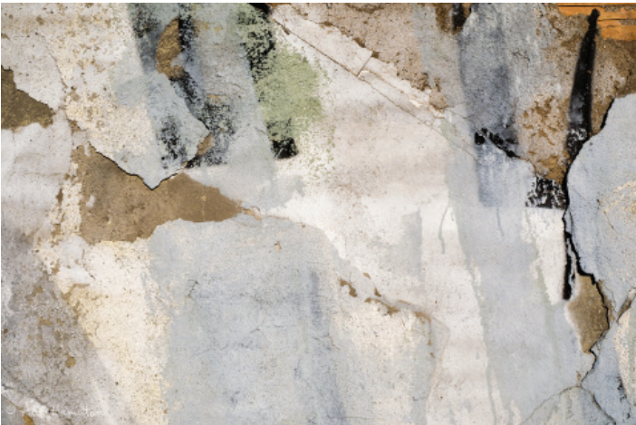
Fenkell For Sale , 2017 - Asia Hamilton with NORWEST (Image courtesy of Art Mile)