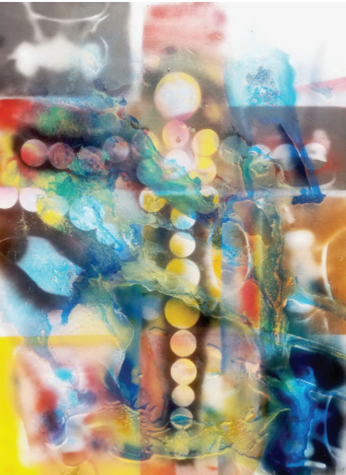
What's Going On... , 2020 - Alphonso Cox with ARTWORK