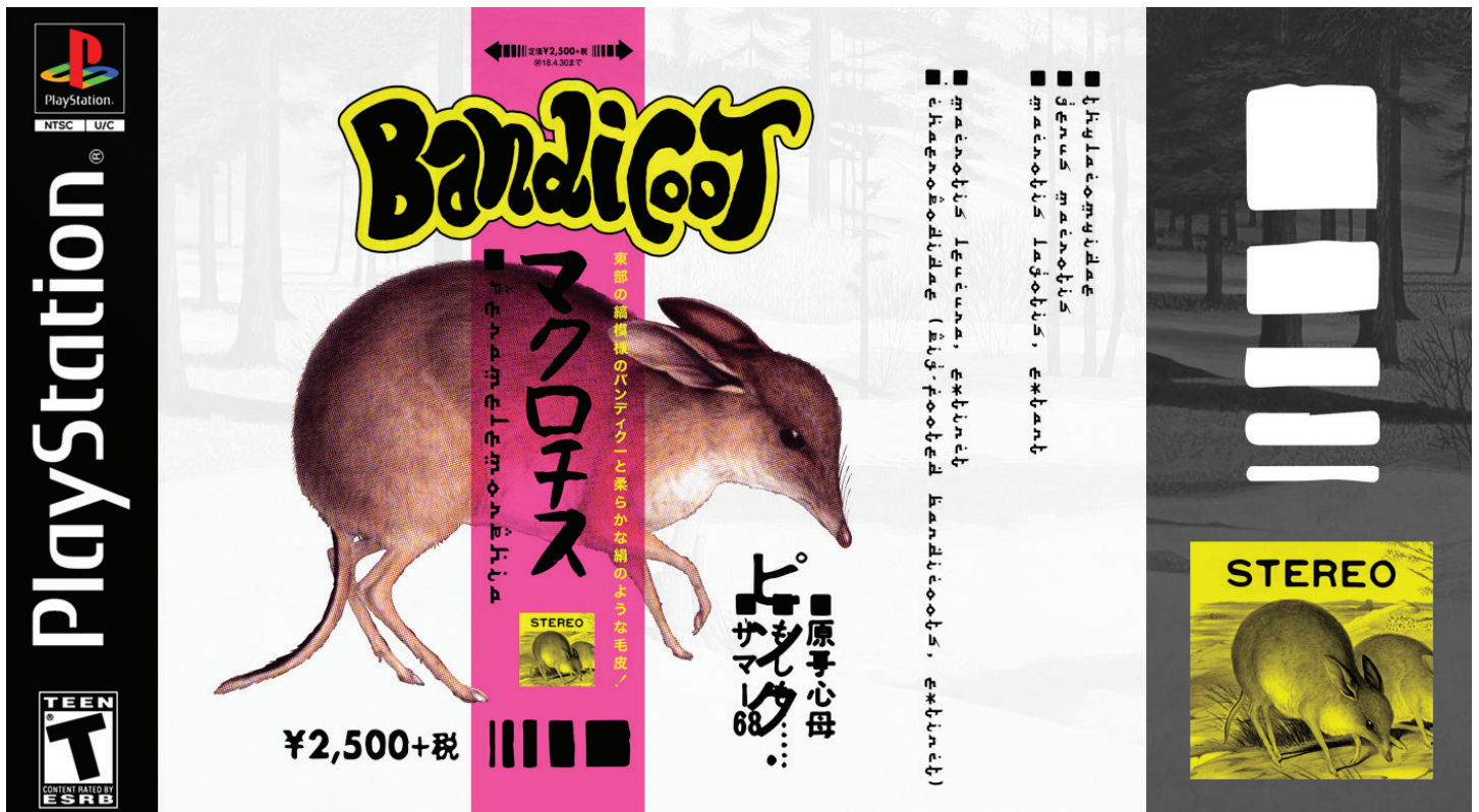
"Trash Bandicoot" by Palm Treat