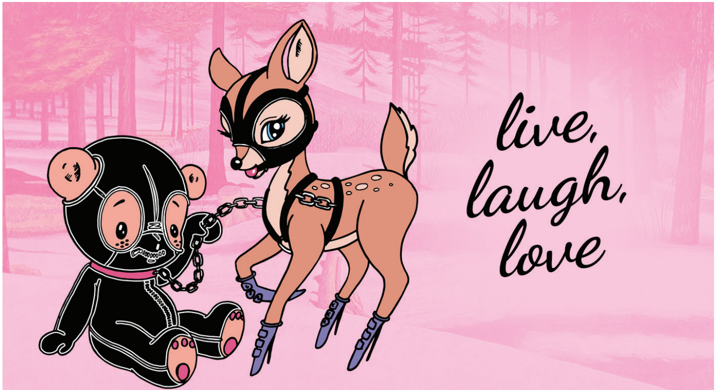
“Live, Laugh, Love” by Palm Treat

Equal parts tax avoidance schemes and money laundering schemes using art as the fence