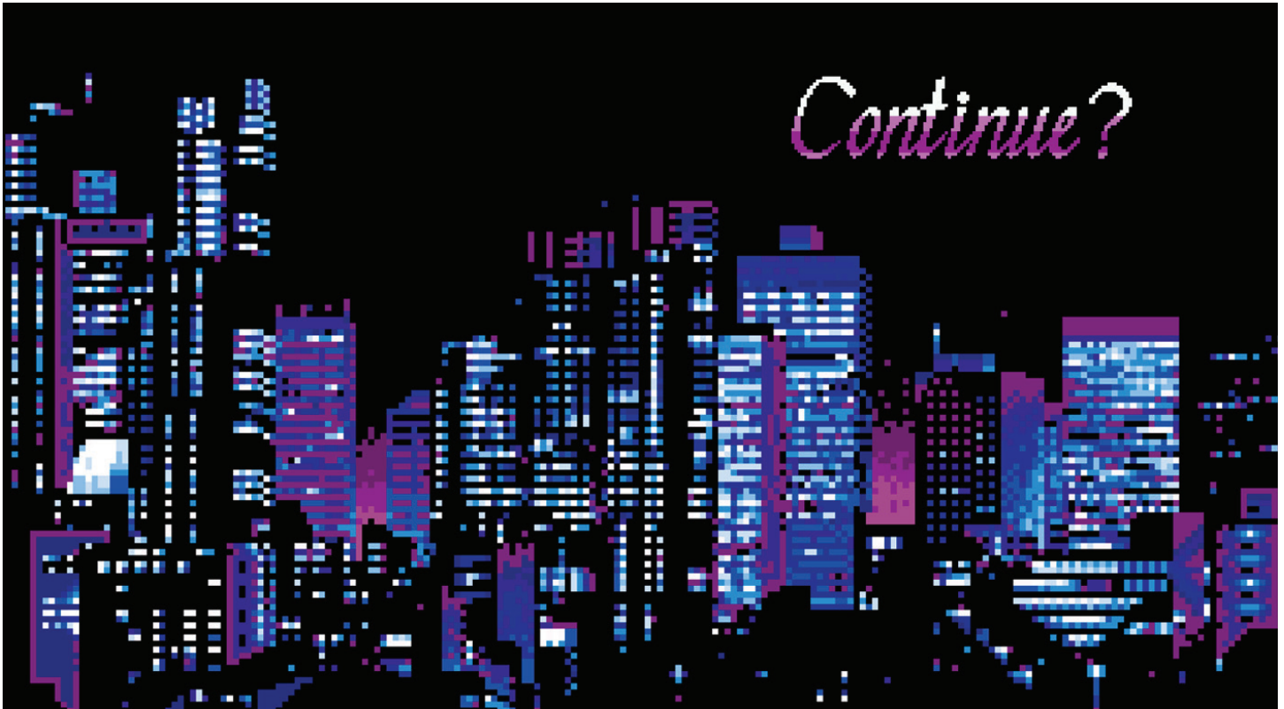
Continue? by Palm Treat

Yeah, vaporwave is sort of like the current flavor of the postmodernism mixtape