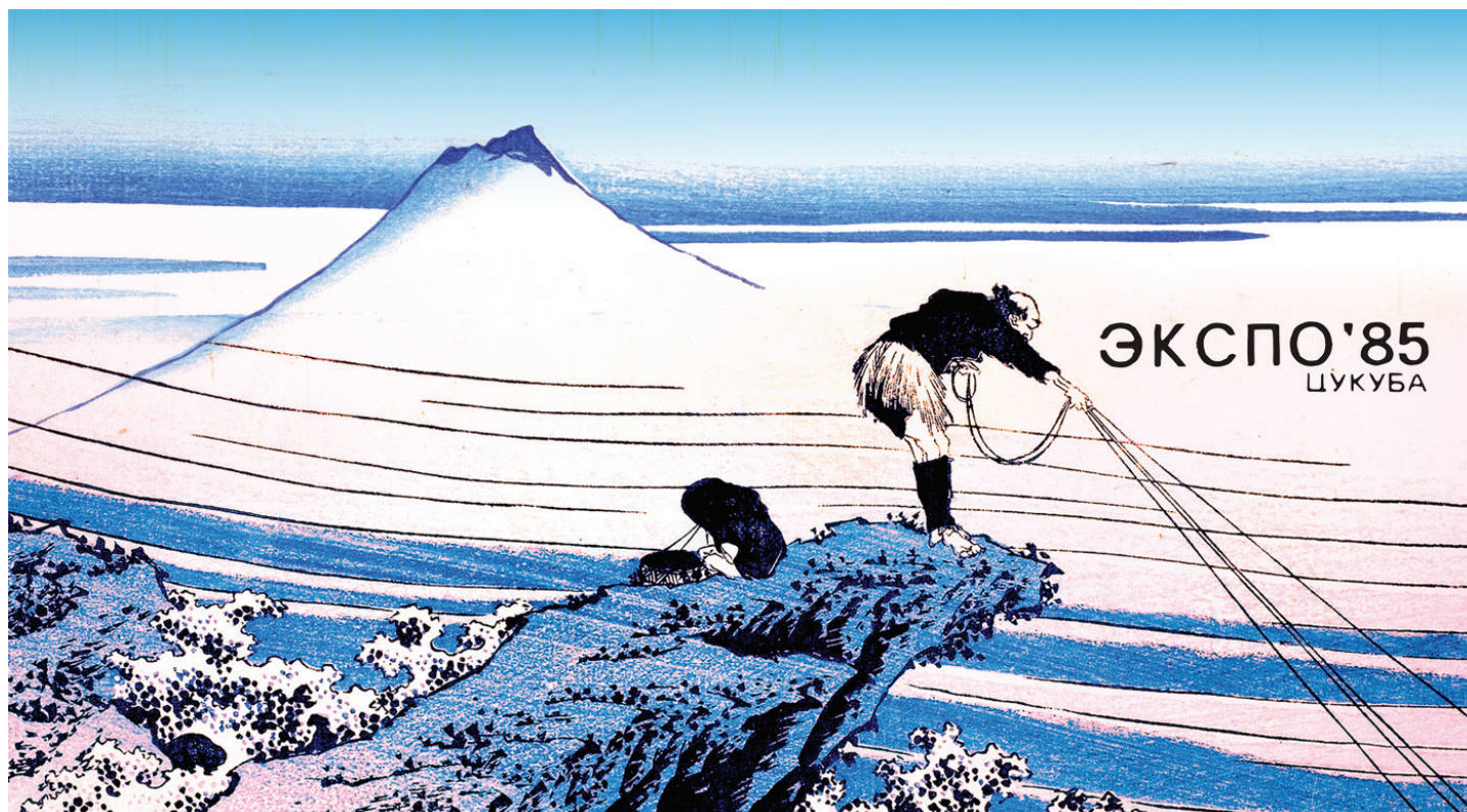
“Europa Expo '85” by Palm Treat